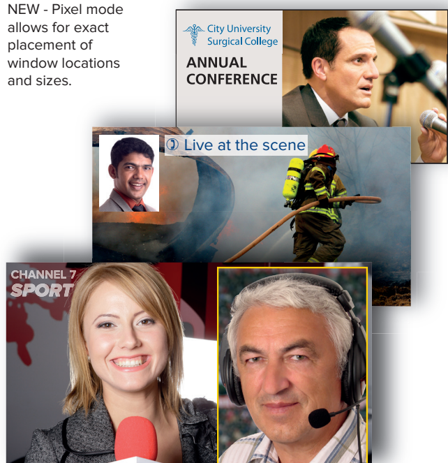
Picture-in-Picture capability - any size, any position

NEW - Pixel mode allows for exact placement of window locations and sizes.